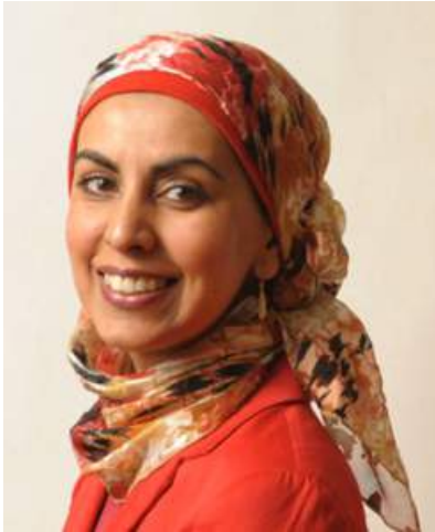
ZARQA NAWAZ Writer, Filmmaker